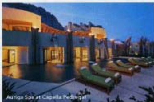
Auriga Spa at Capella Pedregal